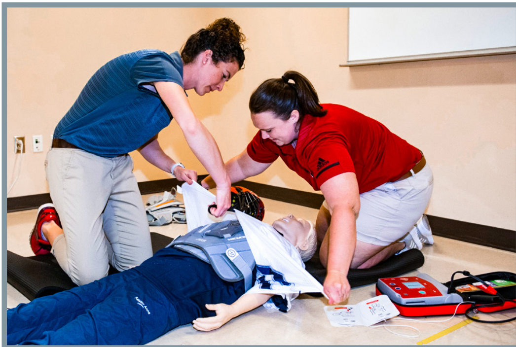
Athletic Trainers from The University of Lynchburg. The Effect of Lacrosse Protective Equipment on Cardiopulmonary Resuscitation and Automated External Defibrillator Shock

US Lacrosse and the US Center for SafeSport are invested in using a centralized database that ensures the safety of children while avoiding harm to individuals affected by the database. In addition, a new or updated centralized database is about to go live on the US Center for SafeSport's website. The research team includes experts on sex offender registration and notification practice evaluation and will provide US Lacrosse and the US Center for SafeSport with detail on who is using the database, how it is being used, and best practices moving forward. In addition, via data obtained from users of the centralized database, the current study will inform internal policies and practices.